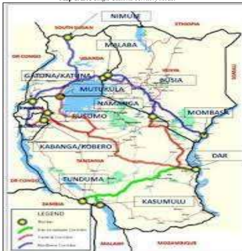
Map-1. EAC Single Customs Territory Model

In this connection, amity and enmity expand in scope and become more complex as cooperation among states widens. This is to mean, the intensity of these relationships at bilateral level especially for enmity is less toxic as would be where three and more states cooperate. Durability and undurability of amity on the other is best tested in an expanded inter-state relationship. The argument supporting this assertion about the drivers of cooperation and integration from which amity and enmity arise are almost obvious; human drivers, actorial (actor based) drivers, ecological drivers, institutional based drivers, historical drivers, and economic necessitants drivers . Human and Actorial drivers are political and cultural by nature, ecological drivers are geographic and circumstantial by nature, and economic necessitants cuts across many other drivers. It is observed that drivers to regional cooperation and integration broadly would be factor based drivers (stated in italics) and reason/objective based drivers (regional market efficiency, cost sharing, mutuality in policy cooperation, and achieving peace and security).