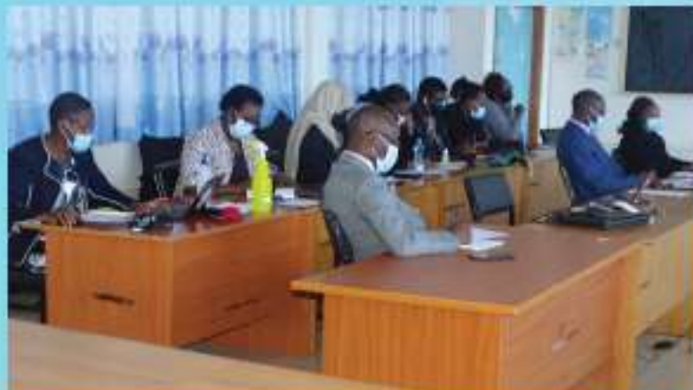
Participants follow keenly during training