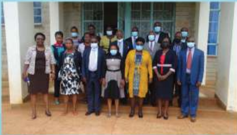
Group photo after training of members